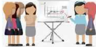
Constituted Bodies (AFB, PCCB, CGE, LEG)