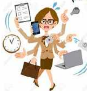
Subsidiary Bodies (SBI, SBSTA, APA )