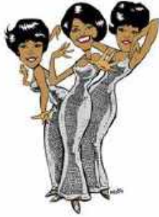
Supreme Bodies (COP, CMA, CMP)