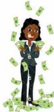
Funds & Financial Entities (GEF, GCF, AF)