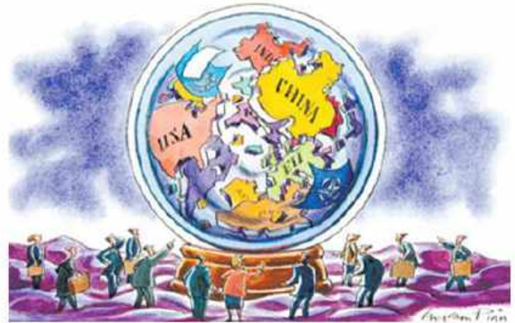
MEMBER STATES / PARTIES

https://unfccc.int/process#:4137a64e-efea-4bbc-b773-d25d83eb4c34